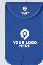
Optional Imprint Back