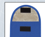
Conductive RFID Shielding Material