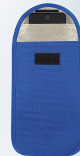
*Phone Not Included