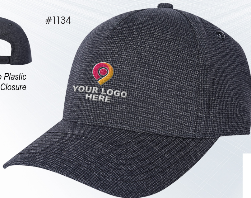
Adjustable Plastic Snap Tab Closure